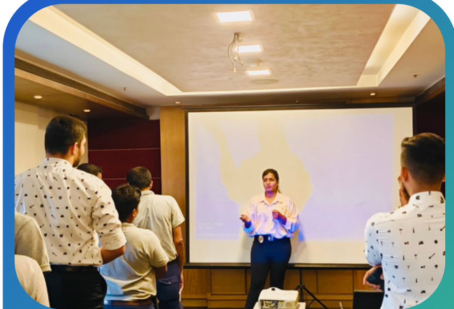
Awareness sessions and workshops