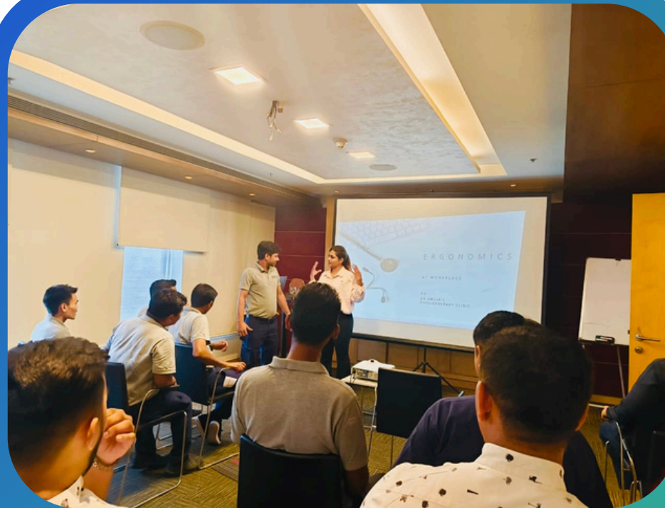
One on one consultation/diagnosis