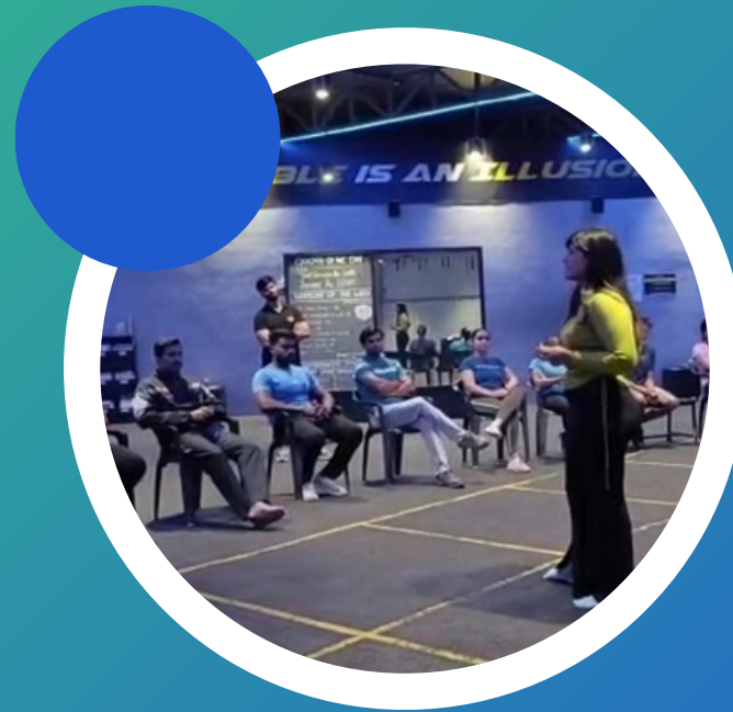
Women's health session